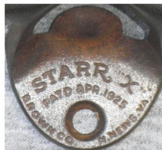
PATD APR. 1925

1935 marks a 3rd label change. Starr "X" becomes a Brown registered trademark name in later years. Openers marked with these labels were produced in the 1935-1943 time period.