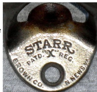
PATD "X" REG