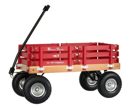
Must have been 100 Red Wagons at the show to haul things around.