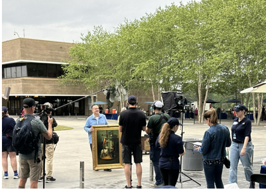
One of the photo shoots for the show.

Also note I saw no Bottle Openers or Corkscrews to be appraised!