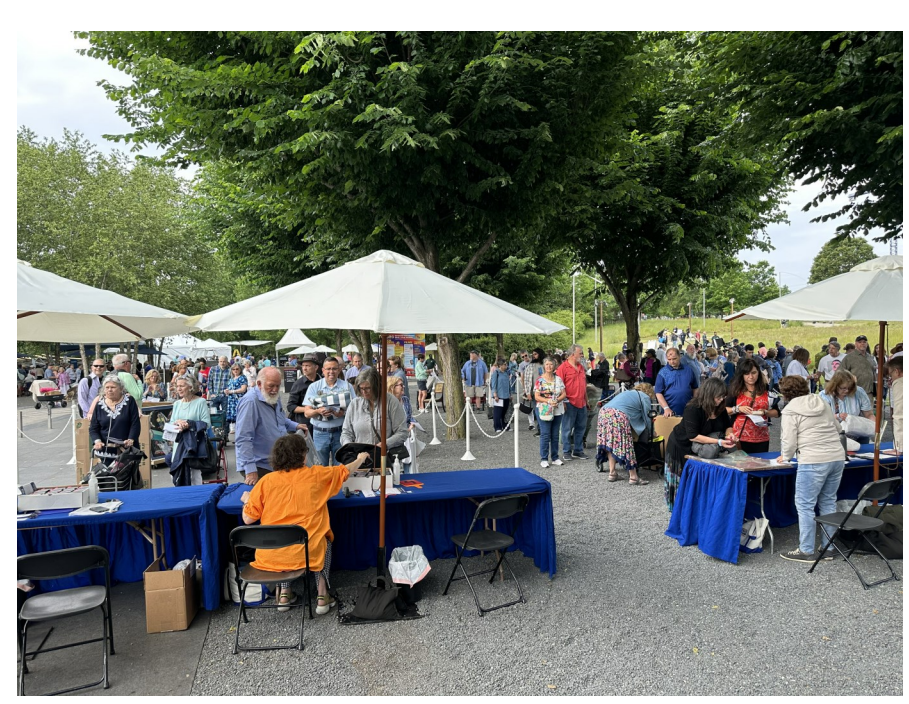
Mid-Morning with the lines getting long.