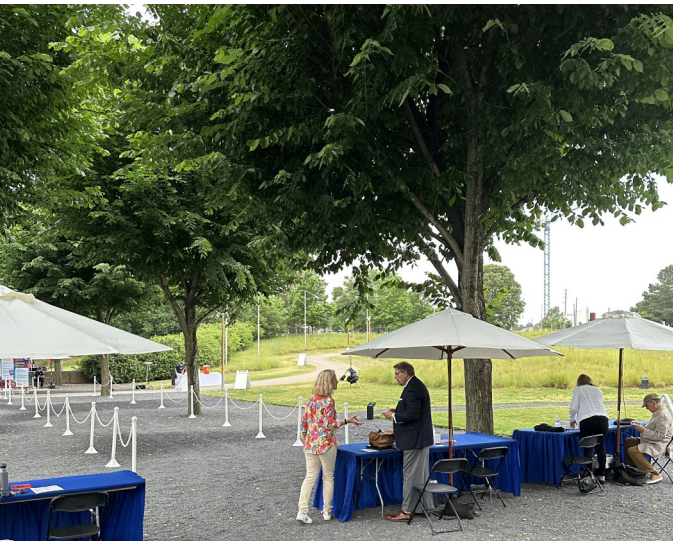
7:00AM before the excitement started, the "Check-In" Roadshow people.