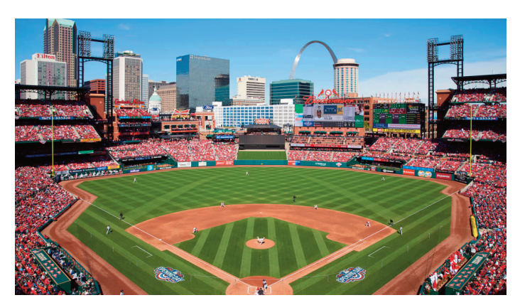
Monday night baseball will feature the St. Louis Cardinals hosting the Texas Rangers. Tickets for the NABA block of seats are limited and can be ordered only via the NABA website www.nababrew.com .

NABA has secured a block of discounted tickets which are available for purchase directly by going to our website, www.nababrew.com on a first come, first served basis. Convention registration is required to purchase tickets from the NABA block, and members will need to provide their own transportation to and from Busch Stadium.