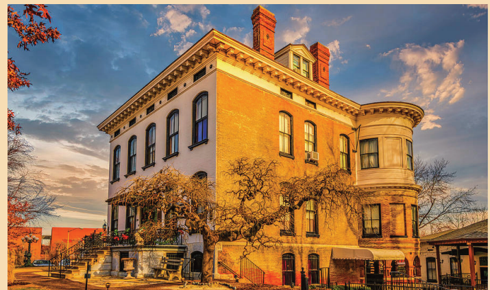
Earthbound Brewing (top) is located in the former stock house of the historic Cherokee Brewing Co. The tour will descend beneath the city streets and explore the caves that were once used as aging cellars.

A visit the to the Lemp Mansion , (bottom) which features a hot buffet lunch, is one of the highlights of the Bus Tour.