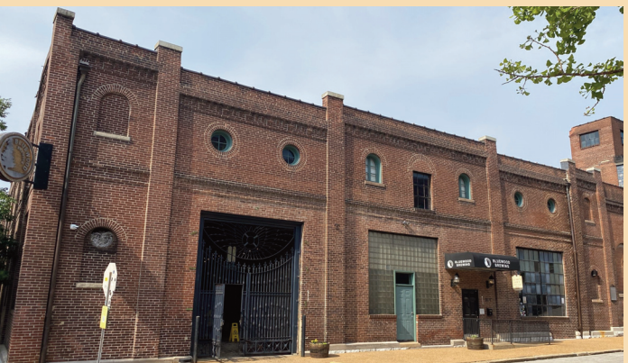
Friendship Brewing (top) in Wentzville, MO is owned by NABA member Brian Nolan, and has a fantastic breweriana collection on display. NABA's version of Alpen Bräu is being custom-brewed for this year's convention by Friendship's Brian Nolan. Tour goers will be first to sample it on tap at the brewery. The beer was patterned after a local Pre-Prohibition recipe.

Bluewood Brewing (bottom) is located in the historic former Lemp Brewery stables, built in the late 1800s.