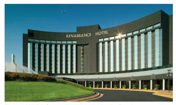
The 2024 NABA Convention will be held at the Renaissance St. Louis Airport Hotel in St. Louis, MO.