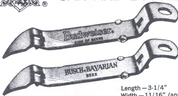
Length — 3-1/4" Width — 11/16" (approx.) Weight — 35 lbs. per M