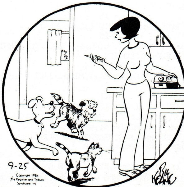
"That was the pencil sharpener for heaven's sake, not the can opener."