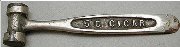
A new style CBO “Double Hammer”.