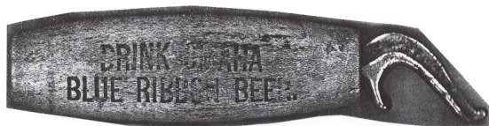
M-134 WOOD HANDLE CAP LIFTER (NO CORKSCREW) CAST IRON CROWN CAP LIFTER IN HANDLE (SEE P-9, P-139) 5 1/8" ART SANTEN 1. DRINK OMAHA BLUE RIBBON BEER. / SAME