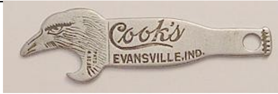
A-70 EAGLE HEAD & BOTTLE NO GAS KEY (SEE A-15) MARKED "C.T. & O.CO., CHICAGO, PAT. APPLD. FOR." OR "C.T. & O.CO., CHICAGO PAT. APPLD. FOR/PATENTED" OR "C.T. & O.CO. CHGO. PATD 4.30.12." 2 7/8" JACK FORD 1. COOK'S EVANSVILLE, IND. 2. COMPLIMENTS OF THE EAGLE SUPPLY HOUSE 242 STATE STREET ROCHESTER, N.Y. (SEE B-13-77)