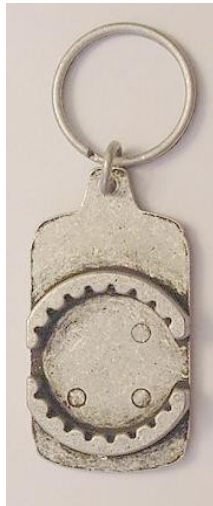
G-67 TWIST-OFF CAP LIFTER/CAN SHAPE 2 3/8" JOHN STANLEY 1. COORS LIGHT