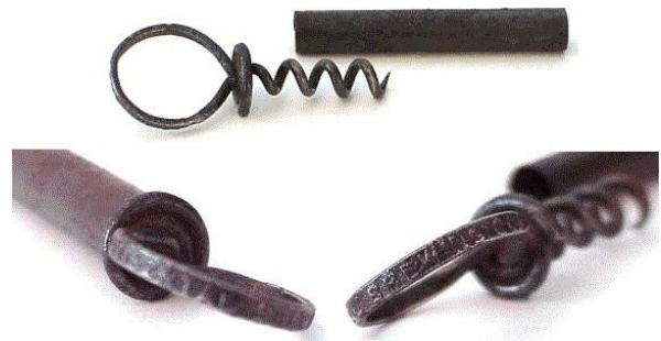
P-162 SINGLE RING WIRE HANDLE CORKSCREW METAL SLEEVE AD STAMPED ON WIRE RING WIRE HANDLE DON BULL 1. CONTINENTAL BREWING CO.