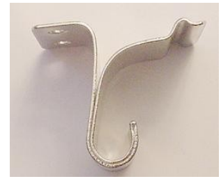
O-22 VAUGHAN'S "NEVER CHIP" MODEL #2 WALL MOUNT CAP LIFTER MOUNTS WITH 2 SCREWS DESIGNED BY HARRY L. VAUGHAN MECHANICAL PATENT NO. 1,029,645 (06/18/1912) (SEE O-4, O-11) 1 1/2" WIDE JOHN STANLEY 1. BARTL BRAU LA CROSSE, WIS.