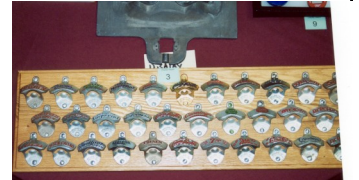
Some miscellaneous displays, above and to the right, thanks to all members who entered displays!