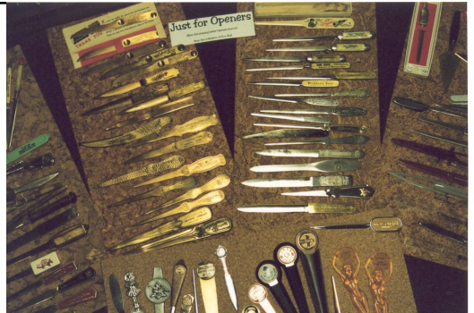
Don Bull's Beer Advertising Letter Openers