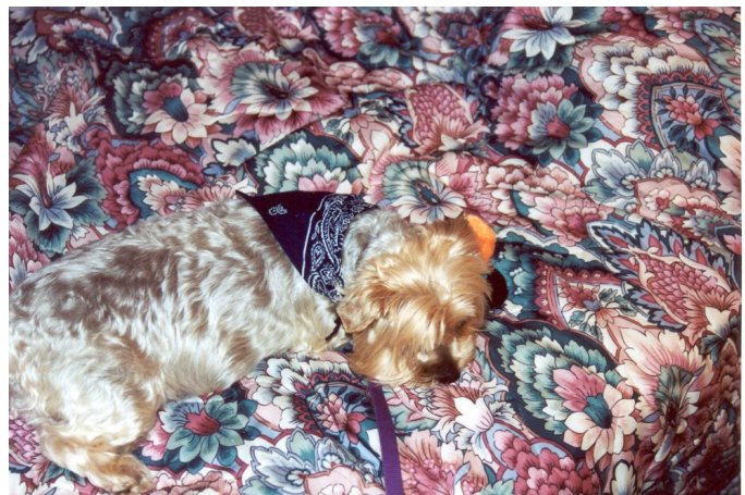
Of course Corkie "The Yorkie" guarded all of the openers!