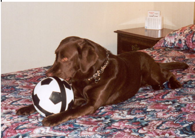
Bailey Young needed something more than openers to play with, One thing for sure she is a good watch dog!