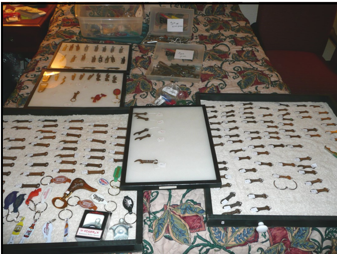
Above are views of 3 rooms with openers for sale, bottom right is Bob Stahly's with a lot of empty spaces!