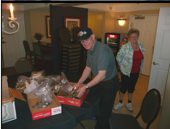
Alex Redl ended buying most of the 50 Cent Openers!