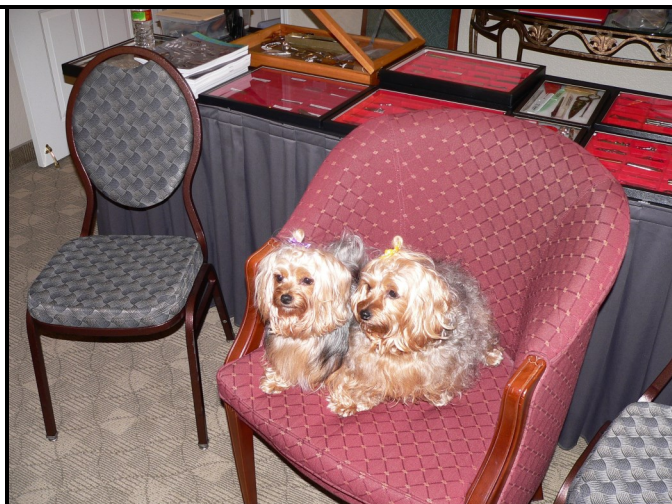
Snazy & Jazy brushed out!