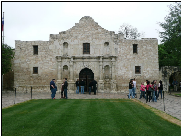
It's San Antonio so you Have to Start with the Alamo