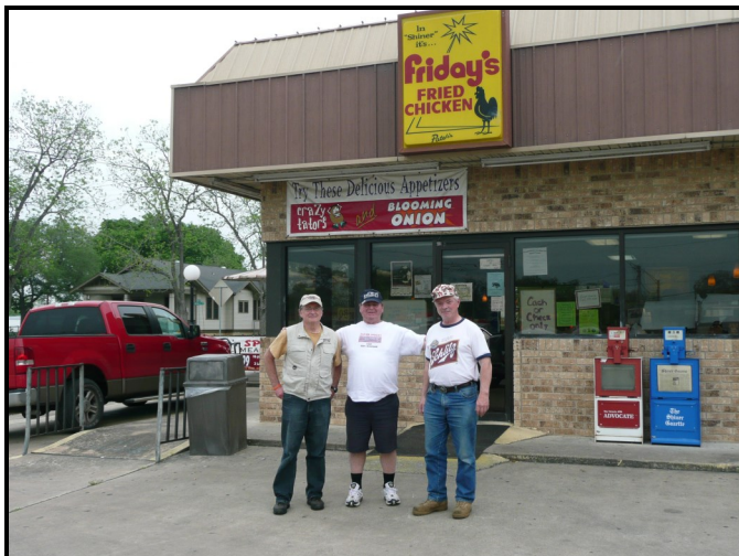
Saturday Lunch at Friday's Fried Chicken