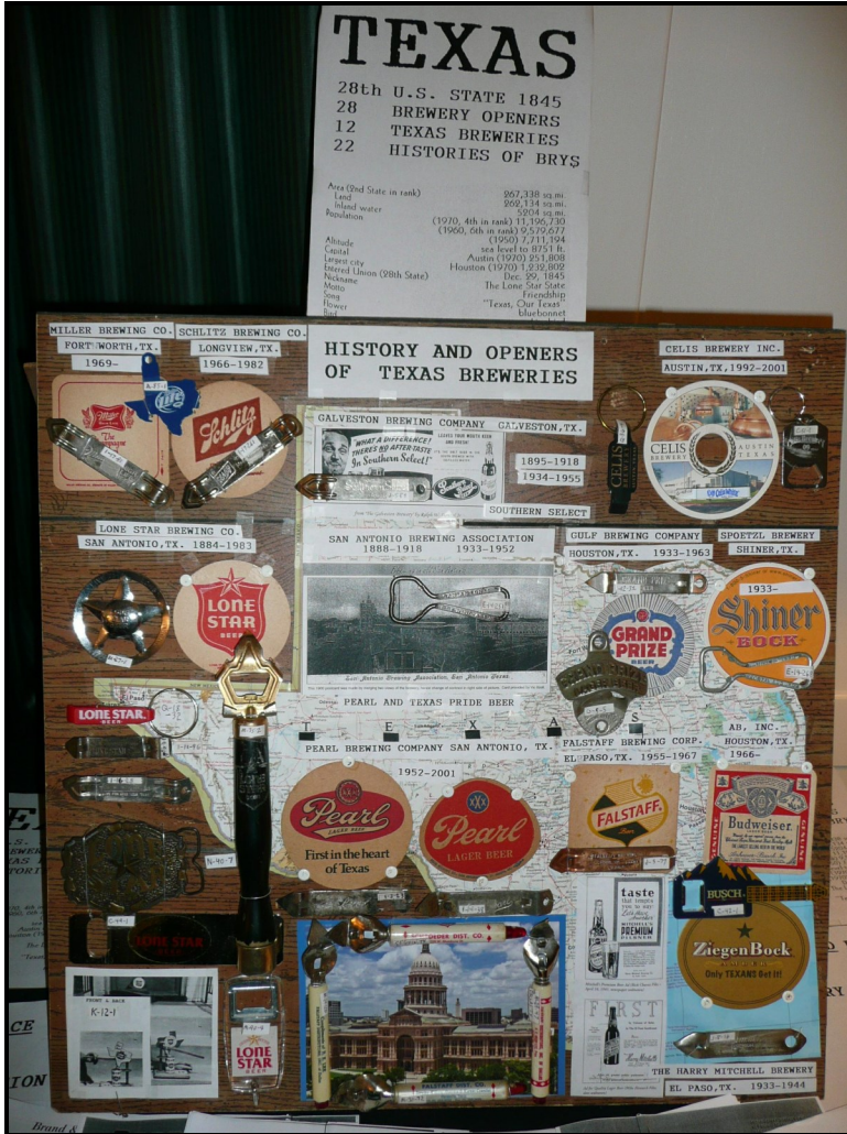
Above: Art Santen's "Texas Openers" display (3rd Place)