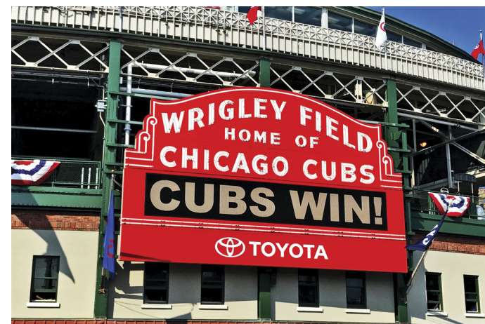
Monday night baseball features a game at historic Wrigley Field. There are a limited number of tickets, which may be purchased only through our website, www.nababrew.com .