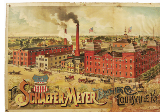
Before (above) and after (below)

Our Jersey Shore Chapter will host a post-banquet party from 8-11 PM. This great group of NABA members are legendary for their ability to throw a party, and there's always a theme, which is being finalized for announcement soon.