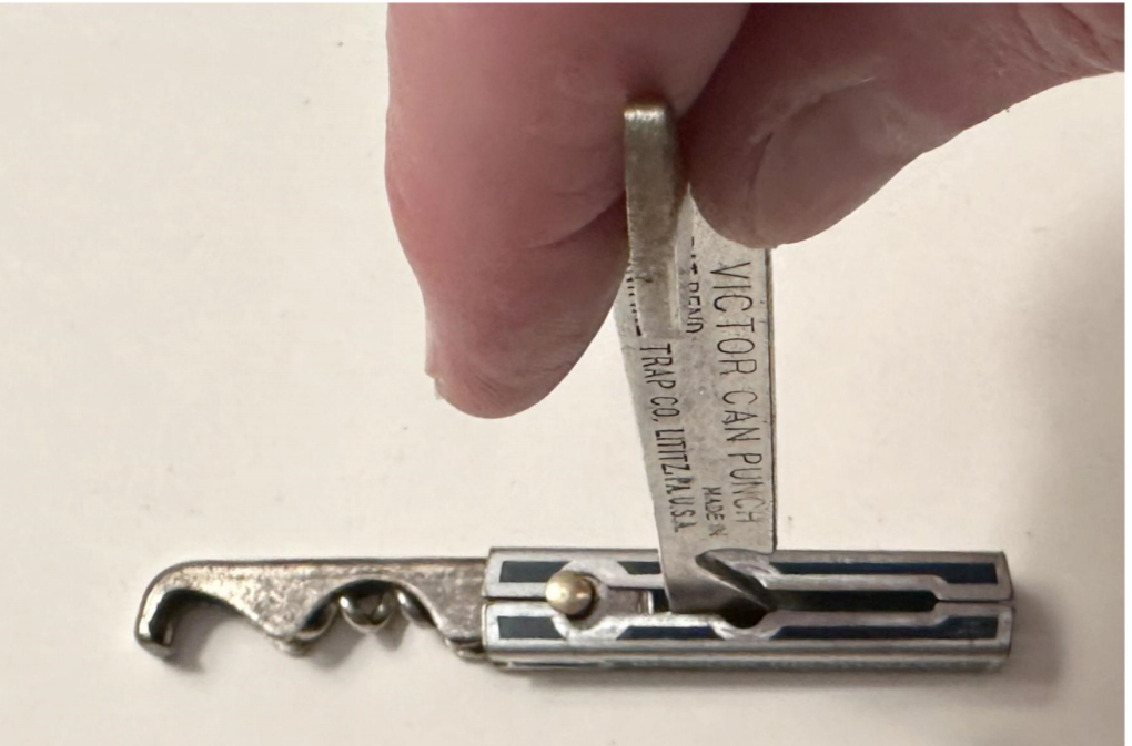
Button with pin shown below.