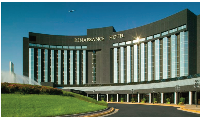
The 2024 NABA Convention will be held at the Renaissance St. Louis Airport Hotel in St. Louis, MO.