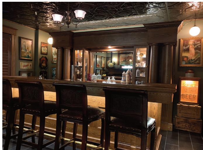
Dave Birk’s beautiful home features a remarkable collection of lithographs and etched glasses, presented in an unforgettable speakeasy setting.