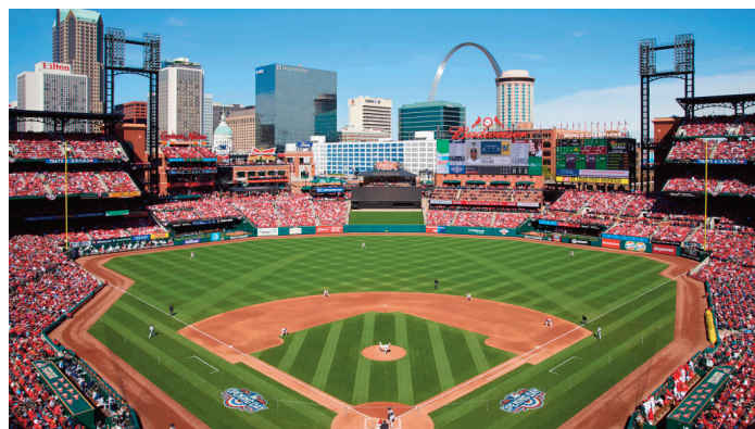
Monday night baseball will feature the St. Louis Cardinals hosting the Texas Rangers. Tickets for the NABA block of seats are limited and can be ordered only via the NABA website www.nababrew.com .

NABA has secured a block of discounted tickets which are available for purchase directly by going to our website, www.nababrew.com on a first come, first served basis. Convention registration is required to purchase tickets from the NABA block, and members will need to provide their own transportation to and from Busch Stadium.