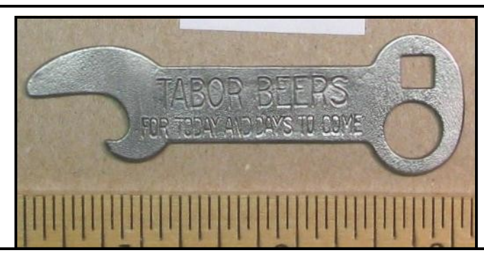
A B-21-UL Tabor Beers, is this foreign or does anyone know anything about this brand or where it is from???

Corrections form the October issue. Please change G-112 to G-120 and G-113 to G-121.