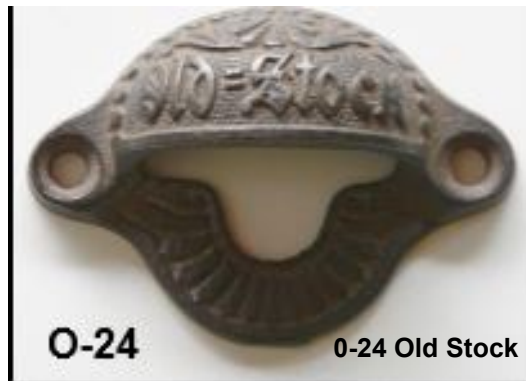
O-24 Old Stock