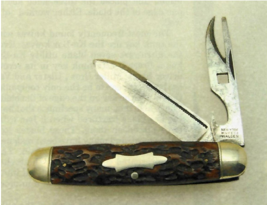
This is a two blade New York knife that features an unusual screwdriver with the Prest-O-Lite key. Another variation on a theme of specialty offered pocket tools.