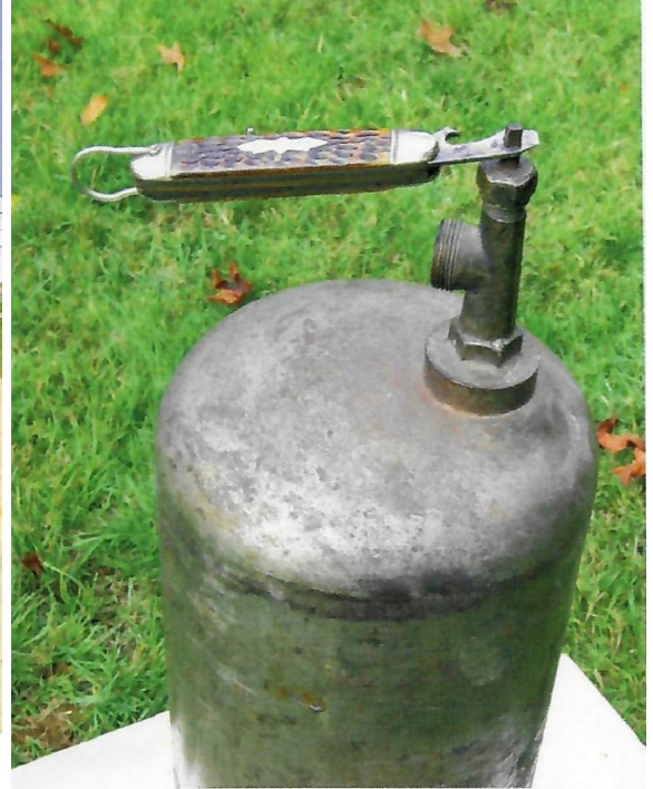
A Prest-O-Lite acetylene tank is located on the running board of this 1911 Model T Ford. This was the pre-electric light system, before batteries were used to power the headlights.