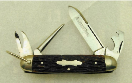
This unusual Miller Brothers utility knife also has the key wrench in its screwdriver blade.

key around my neck along with a real skate key. During the education process, I did learn how to tell an official Boy Scout knife from a utility knife. A Scout knife can be a utility knife, but a utility knife doesn't have to be a Scout knife. A Boy Scout (or Girl Scout) knife is a knife which was sanctioned by the scouting organizations. It will usually have an official logo/emblem or etching on the blade attesting to its official status. Utility knives are knives that may have a tool incorporated into them, much like the tools that one can find in an Official Scout knife. Many Scout knives have a screwdriver blade, a punch blade, a can opener and cap lifter blade, and a cutting blade. But please take note that the square hole does not appear in any official Boy Scout or Girl Scout knives. You say you have one? Then I say you might have one that is not as originally produced. Someone's fantasy maybe?