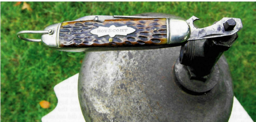
The Prest-O-Lite tank used acetylene gas to light the headlights of early automobiles. Losing the turn of/on key supplied with the tank made the pocketknife key wrench a life saver.