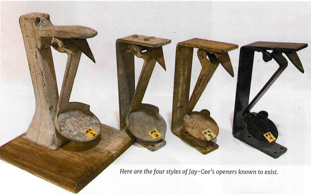
Here are the four styles of Jay-Cee's openers known to exist.

achieving the success he had hoped for. In a busy bar, his can opener was indeed very quick and easy to use. The motion of pulling the can in the swing arm into the can piercer hook, however, shook the can, creating quite a mess.