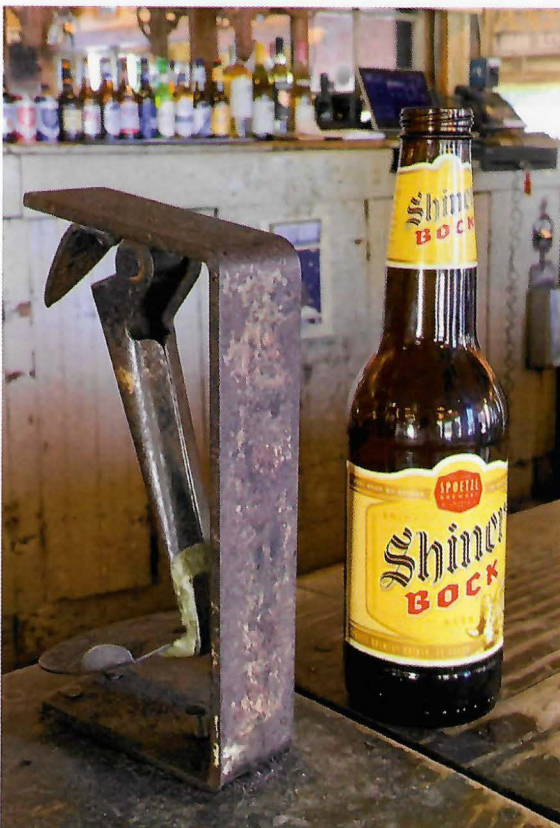
Here's a picture of a Pearl Beer version, the only Jay-Cee still in the wild! It's at Gruene Hall, Gruene, TX, the oldest dancehall in Texas.