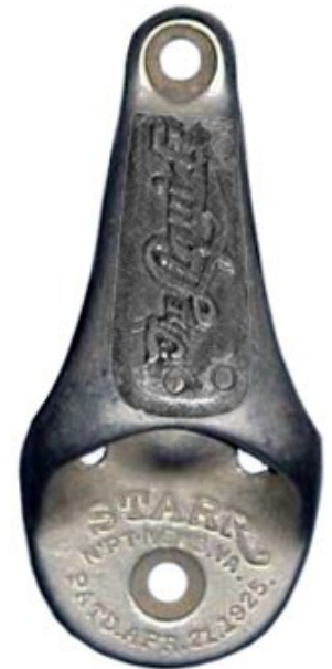
0-505 The Liquid