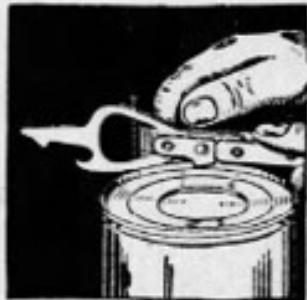
1. CAN OPENER. Safe . . . easy-to-use . . . quick. Lifts lid automatically.

"Opens Everything In The Kitchen" By Don Thornton