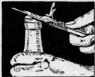
4. BOTTLE-CAP REMOVER. Most efficient on market.