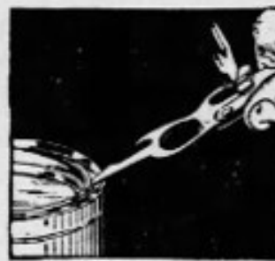
3. PRYER FOR PRESSED-IN COVERS. Works on any type can.