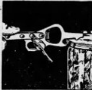
2. JAR OPENER. Opens covers even when close to jar.