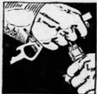
5. CORK SCREW. Affords good grip. Never loose. Fits back into handle.