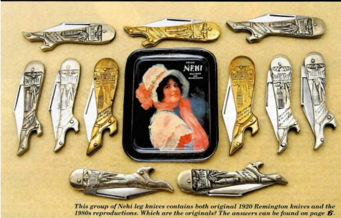
This group of Nehi leg knives contains both original 1920 Remington knives and the 1980s reproductions. Which are the originals? The answers can be found on page 6.