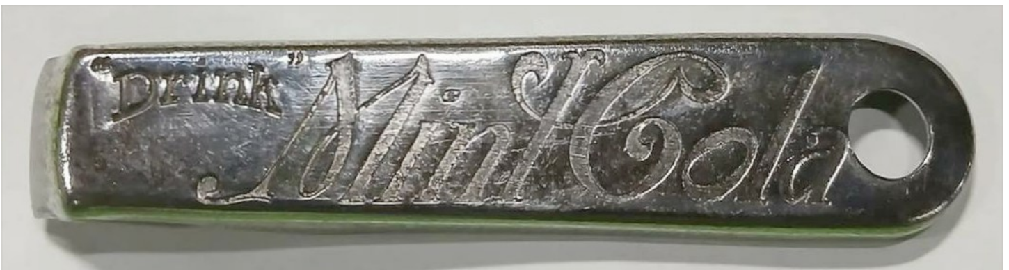
H-002 Drink Mint-Cola