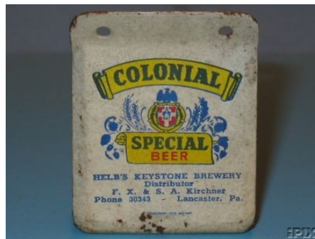
Above is the O-2-UL from Helb's Keystone Brewery which sold this past month on eBay, I had not heard of this brand ???