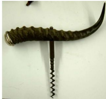
Above is tusk shaped handle with a sterling cap end and the corkscrew shaft is marked Bartholomay Rochester on 2 sides. Shaft is just like a P-42. In one way it is a new discovery but I believe someone other than the brewery made the piece. Any thoughts from anyone???