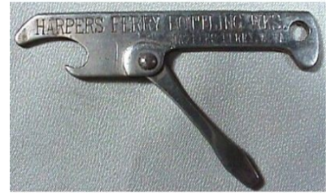
Above is the B-48 Harpers Ferry which brought $277 on eBay