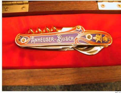
Above is the 2000 version of an P-26 A-B knife (Made in China) and comes with a wooden box.