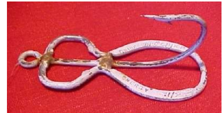
Above is a nice home made E-3 Dr Pepper opener and fish hook. I don't know if you can fish with it but it is an interesting combination. Worth $3-5 as a conversation piece.