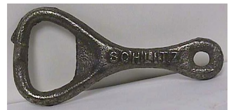
I forgot to bid on this, I think unusual D-Schlitz, which always has the square gas key hole in the back. This one has a round hole. Is it common or have I just missed noticing a round hole one before?