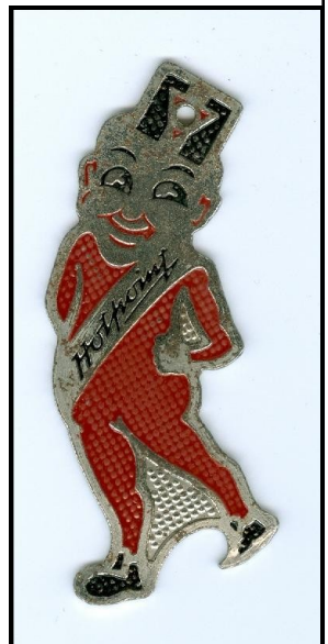
Above an Interesting Flat Figural I bought from Australia with advertising for the "Hotpoint Man".