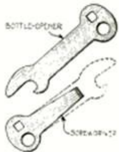
This little bottle-opener reformed and became a screw driver

The little bottle-opener is usually made of hardened metal and is well worth the time spent in transforming into a screwdriver. Try it and see.