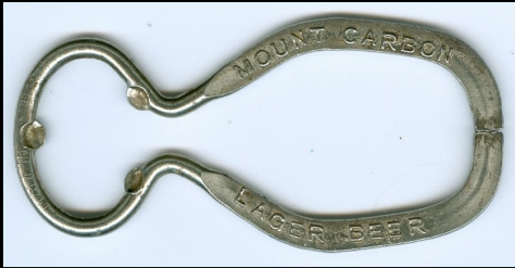
2009 “New Discovery” E-34-1 Mount Carbon Lager Beer. Combination E-2 Top and E-1 Bottom.