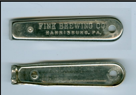
H-14-1 Fink Brewing Co. Harrisburg, Pa. with Milk Bottle Opener (Sharp Point left side bottom pic).