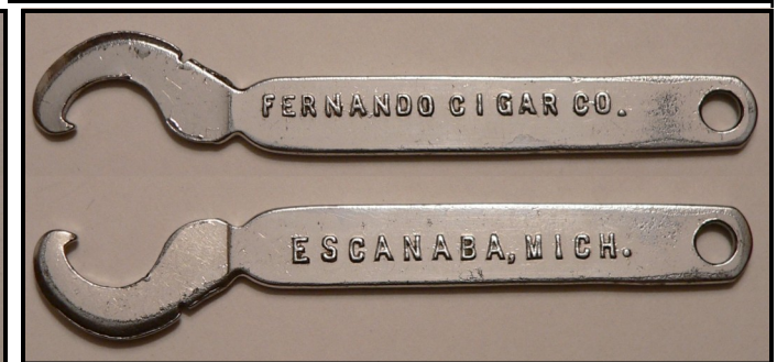
(Left Top) H-9-Soda (2 Known):

JUST HOLLER FOR POLAR SPARKLING WATER LEICESTER POLAR SPRING CO. WORCESTER. / SOUVENIR GRAND COUNCIL MEETING U.C.T. PROVIDENCE, R.I. JUNE 4&5, 1909