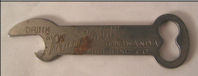
B-18-UL Tonawanda (first beer opener found from this NY town) (sold for $154.50). Right: CBO-PKT-10 Smokecraft Segars (sold for under $10 on eBay).

Opener, Small Cast Iron Pistol Shaped w/ Bottle Opener Hook & Ivory Grips, 4, $280.99 Z-Opener, US 1934 Chase "Squeezit" Bottle Opener, 6, $32.50 Z-Opener, US 1934 Chase "Squeezit" Bottle Opener, 8, $37.00 Z-Opener, US 1934 Chase "Squeezit" Bottle Opener, 8, $37.29 Z-Opener-AUS, Wooden Marble Top Bottle Opener Cook Supplies, 8, $321.50